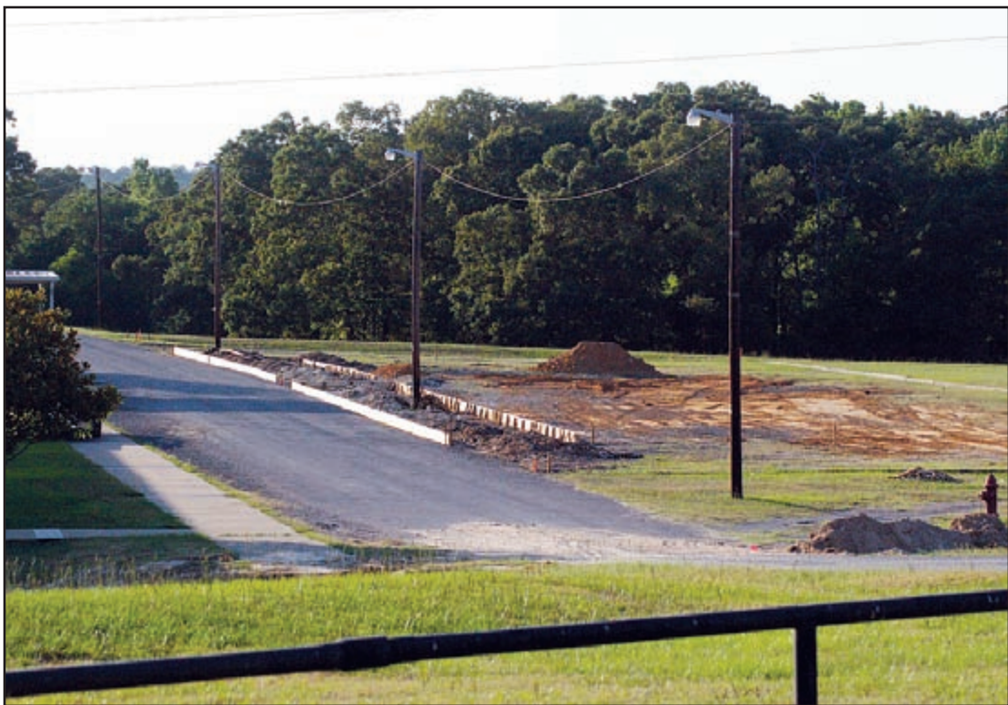
Forms are set to begin pouring a new parking lot at the junior high building, an improvement that came out of the Board's recent goal-setting meeting.

Monday's meeting they reported on some of the more noteworthy sessions offered in San Antonio and Fort Worth, including instruction technology, board communications with the community, and school security measures.