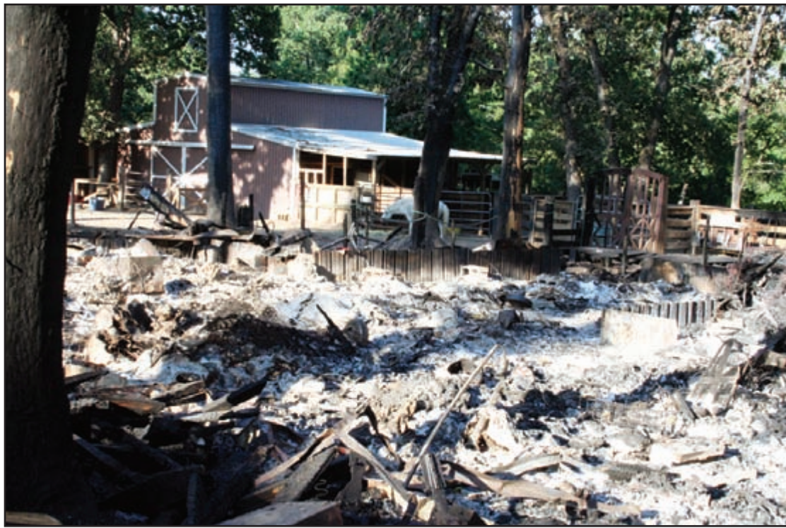
Ash and rubble are all that remain of the beautiful "Hickory Ridge" ranch home.