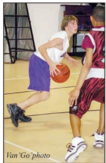
Van 'Go' photo

The Bison travel to Centerville for their next district game on Thursday, 1-22.